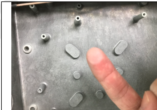
7. Dust deposit inside the enclosure after dust test.