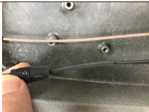
8. Dust deposit inside the enclosure after dust test.